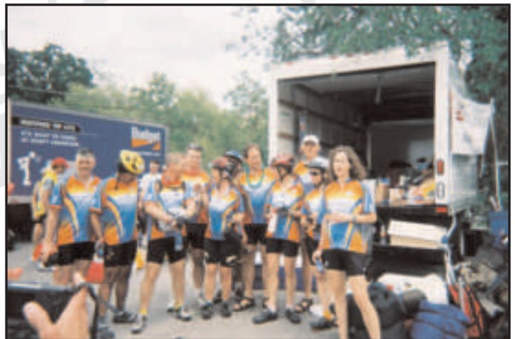
What an audacious team!!

Okay.. and for my personal proudest moment. Yes.. I haaaaaaaave to share!!! While waiting and waiiiiiiiiiiiiiiiiiiting in line to get going on Sunday, I took the opportunity to run to the port-a-potty. Well! Yikes and egad!!! I forgot to remove panties when I was awakened at the crack of dawn. Do you knooooooooooooooooow how uncomfie that can be on a 71 mile ride????? Soooo....yepers... I left 'em right there in the port-a-potty. After all, the sign said no diapers. It said absolutely nothin' about underwear! I then proudly explained to our brilliant little pelaton (and the many bystanders) how I had saved myself just in the nick of time! It was a proud (or something) moment for us all. Yep. ..gloating again!!!! Hey! At this point in life, what good is shame?!!!