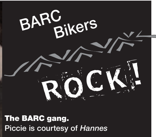
The BARC gang. Piccie is courtesy of Hannes