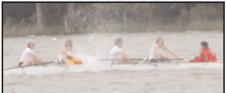
See more pictures of BARC Space City Sprints on p. 5 & 7.