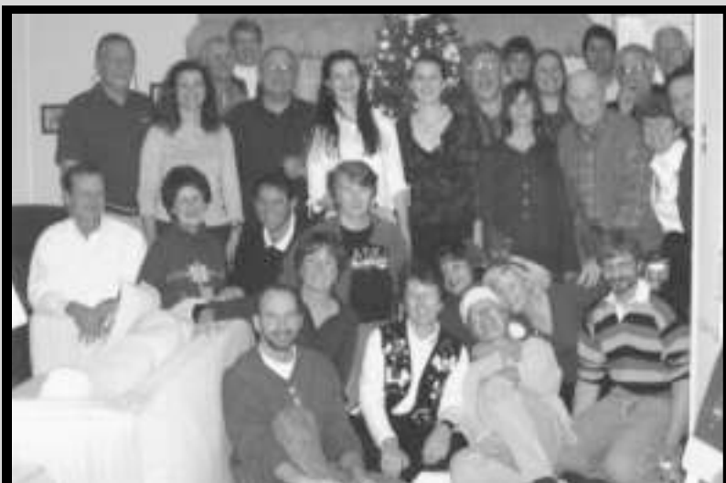
THE 2002 PARTY SCENE