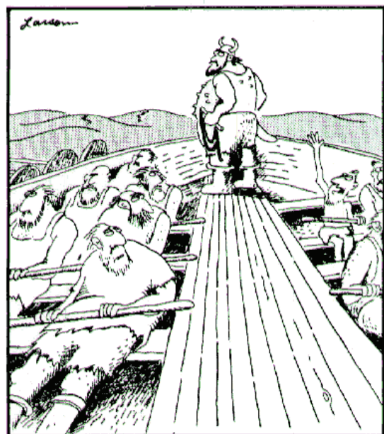
"Yoo-hoo! Oh, yoo-hoo! ... I think I'm getting a blister."