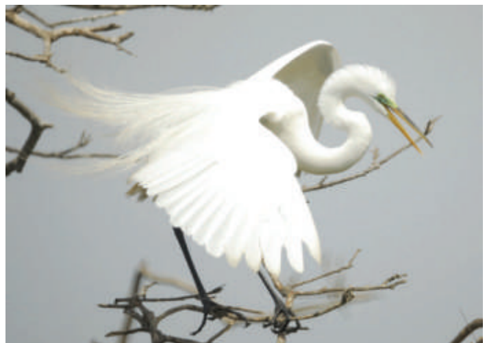
A Great Egret in breeding plumage displays a beautiful green on his face.

vanity pushed the price of egret feathers to twice that of gold. In the 1890's, almost 150,000 "scalps" were sent to milliners in New York. Parent egrets won't leave their young even if in danger themselves. Hunters decimated rookeries, often leaving dying, scalped parent birds to rot and their nestlings to starve. In 1905, there was a public outcry, when a Florida warden tried to arrest egret poachers and was shot to death, leaving a wife and two small sons. During this time, insurance companies cancelled coverage for feather factories. In 1913, an act of Congress restricted the use of plumes on hats. The Audubon Society, continues to protect birds around the nation.