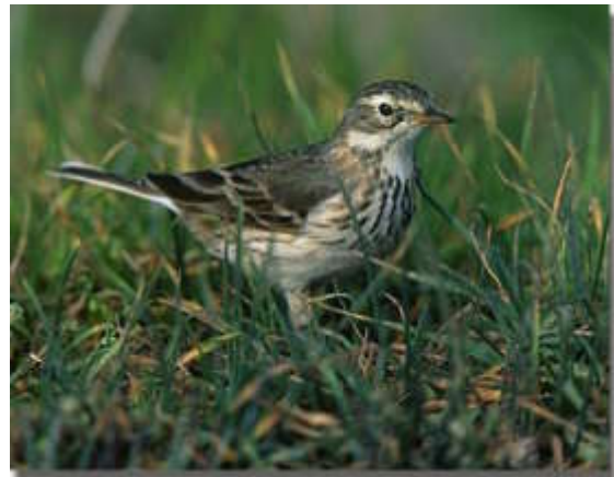
American Pipit formerly known as the Water Pipit

Formerly known as the Water Pipit, this small sparrow sized bird is named for the sound it makes 'pipit'. It wags or bobs it's tail and is often seen in flocks walking in the grass in many parks in the area. Yes, it does not really hop, but walks. It breeds in the Arctic tundra and visits Texas during the winter on their long journey to Guatemala and El Salvador. Although I have never seen pipits in Clear Lake Park, these birds can be seen at other parks in the Clear Lake area.■