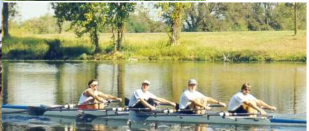
Marathon Championships, 1997