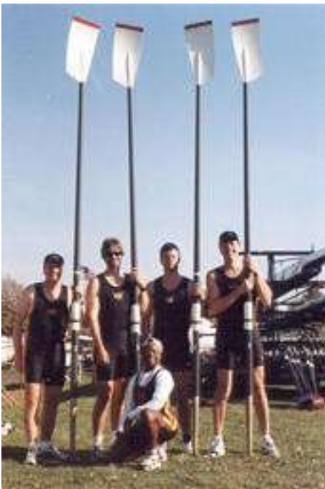
Head of the Charles, 2001