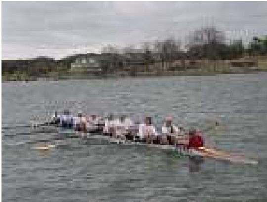
Great 8 competing at HOT in Austin, Texas