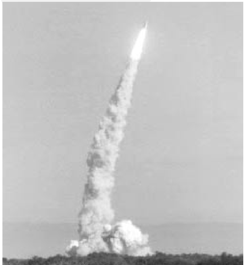
Columbia Launch, January 16, 2003