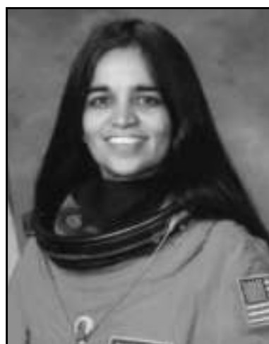
K.C. Kalpana Chawla