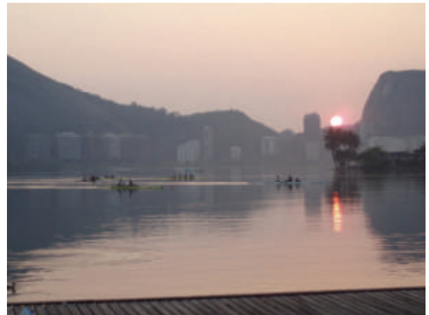
Rowing in Rio de Janeiro at sunrise.