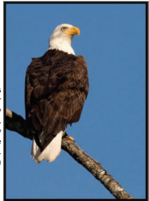
A Bald Eagle recently spotted at Baytown Nature Center.

Although some might confuse this beautiful bird with our more popular Osprey, one can clarify this bird by the solid white tail and head. Also, they are much larger in size. Every winter, rowers have a good chance of seeing these magnificent birds. So stop and enjoy them while you are out on the water. ■