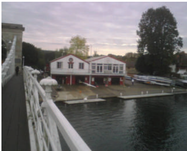
Marlow Rowing Club – From the “new” bridge

Continued from page 4