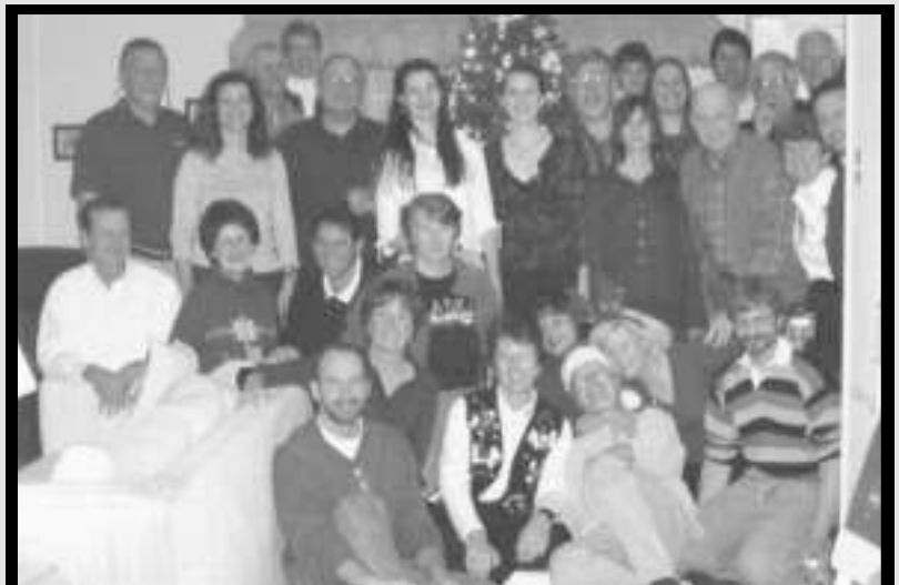
THE 2002 PARTY SCENE